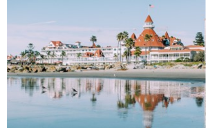
AgVantage Executive Conference Hotel Del Coronado March 11-13 2021 San Diego, California

Please email me your thoughts on these events and the topics you want added to the agenda. We look forward to getting back to learning with and from each other.